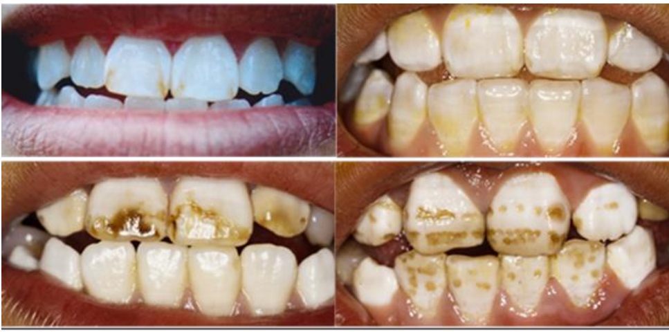
Figure 1: Dental Fluorosis Ranging from Very Mild to Severe

Exposure to excess fluoride in children is known to result in dental fluorosis, a condition in which the teeth enamel becomes irreversibly damaged and the teeth become permanently discolored, displaying a white or brown mottling pattern and forming brittle teeth that break and stain easily. 96 It has been scientifically recognized since the 1940's that overexposure to fluoride causes this condition, which can range from very mild to severe. According to data from the Centers for Disease Control and Prevention (CDC) released in 2010, 23% of Americans aged 6-49 and 41% of children aged 12-15 exhibit fluorosis to some degree. 97 These drastic increases in rates of dental fluorosis were a crucial factor in the Public Health Service's decision to lower its water fluoridation level recommendations in 2015. 98